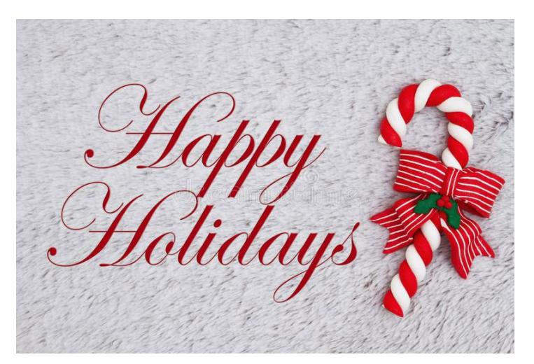
The TGCA staff wishes you all the happiest of holidays. Our office will be closed beginning at noon on Friday, December 20th, until 8:30 a.m. on Monday, January 6th. We wish you all a Merry Christmas and happy and prosperous New Year.